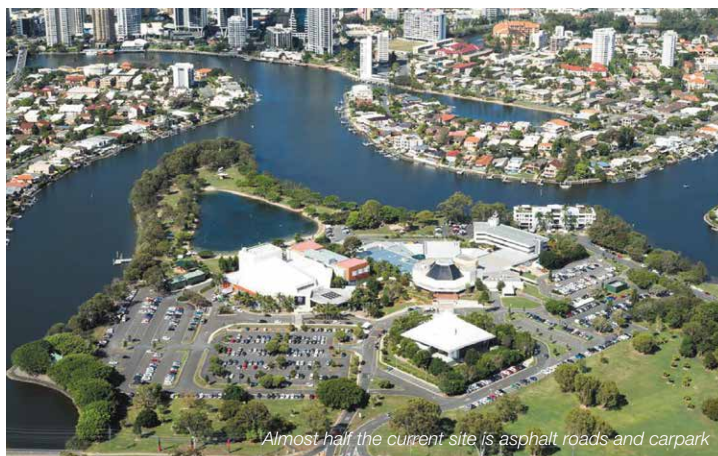
Almost half the current site is asphalt roads and carpark

Public transport options and water transport will also increase over time, along with construction of a pedestrian and cycle bridge linking the precinct to Chevron Island, providing more ways to access the evolving Gold Coast Cultural Precinct.