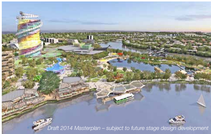
Draft 2014 Masterplan – subject to future stage design development

While we are building our cultural future events and activities will continue at Evandale.